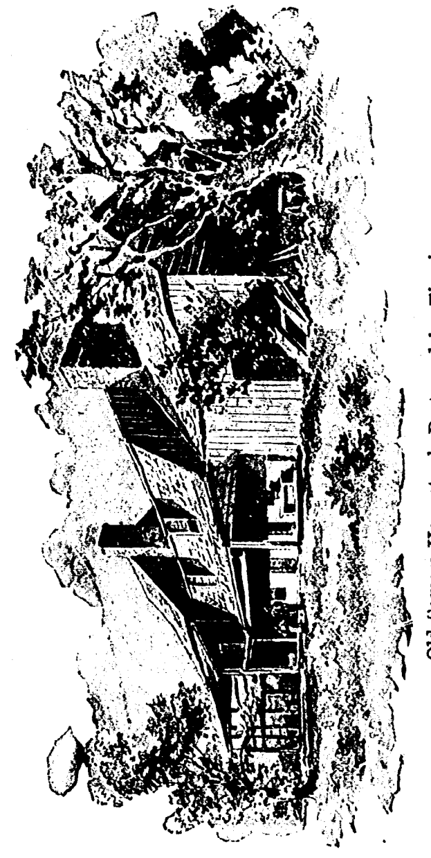
Old Somers Homestead, Destroyed by Fire in 1900.