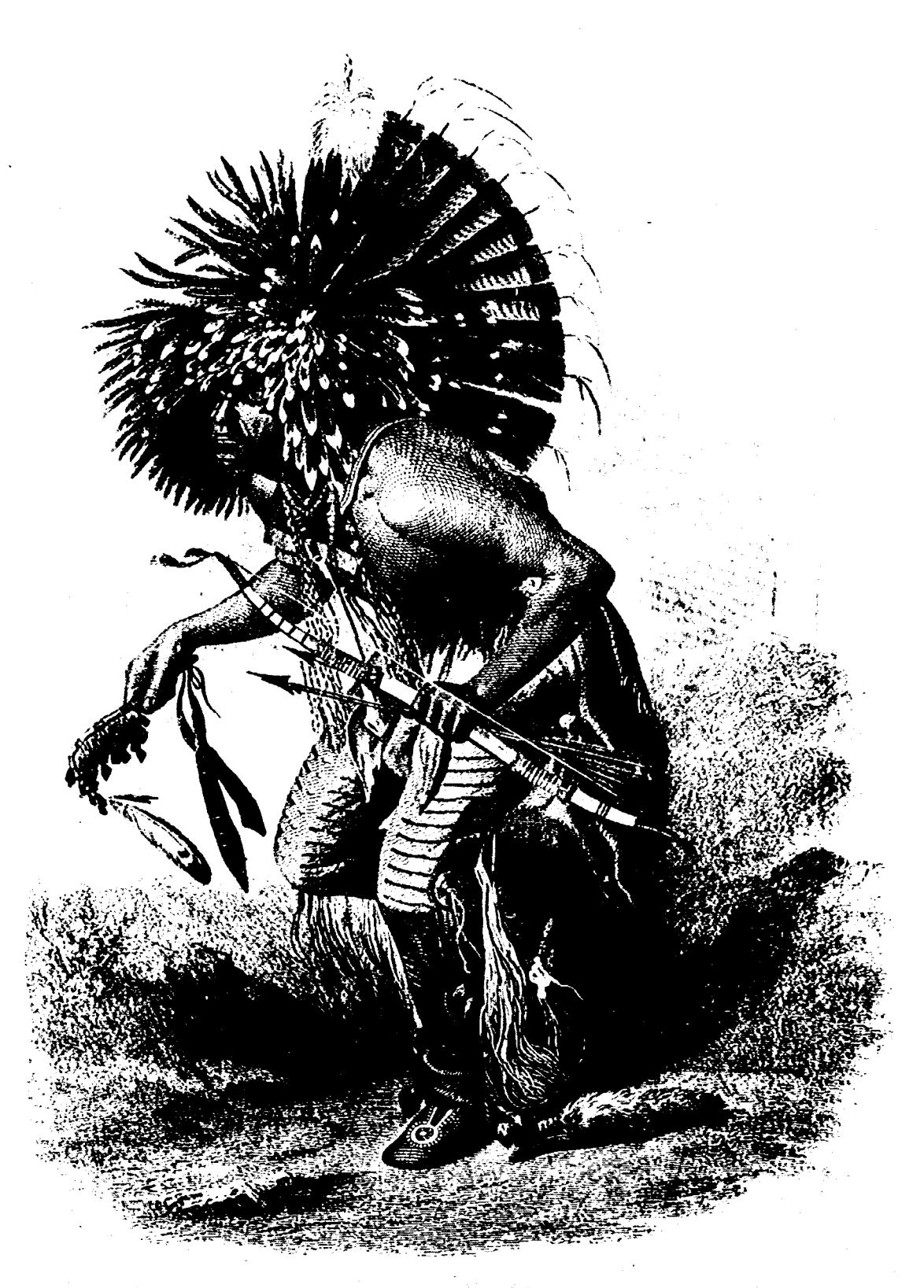
An Indian in Full Dress.